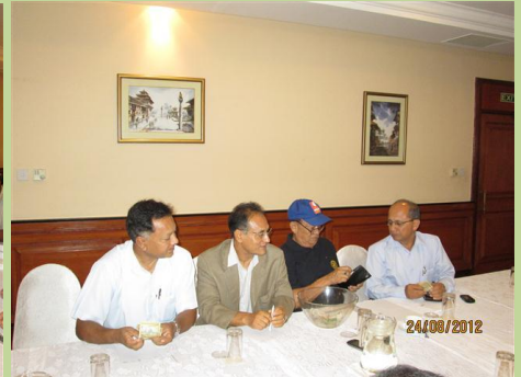
On Aug 31, 2012 DG was briefed by the following Club Committee Chairs on RCK Plan and Program for 2012-13