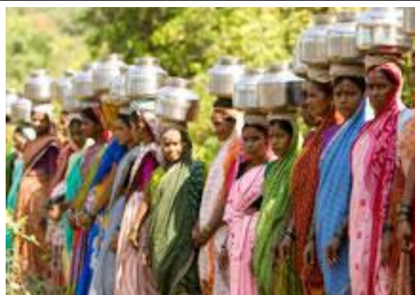
Villagers line up to harvest rainwater. Vihule Kond, India.

Rotary's flagship program is its effort to protect children against polio. It aims to eradicate the disease from the world.